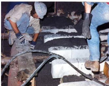
Hearth installation with skid block and castable